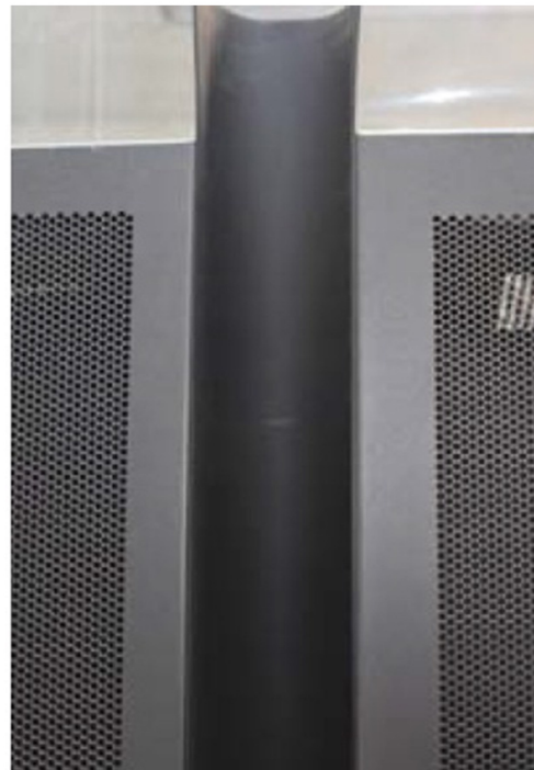
Flexible Gap Seal Between Racks