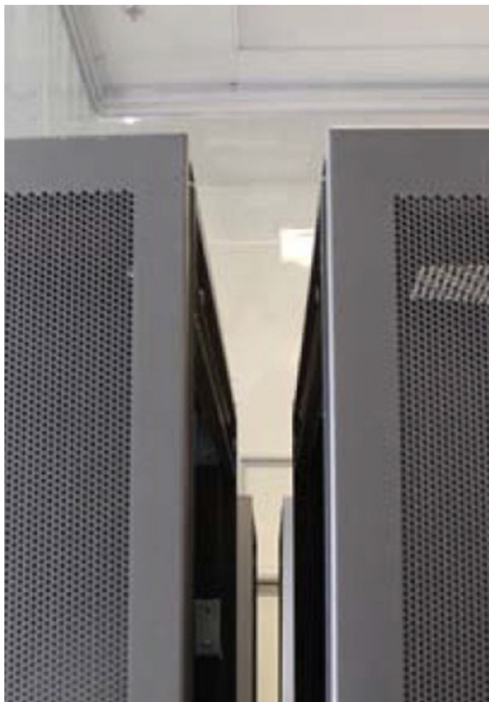
Open Gap Between Racks